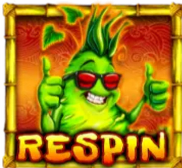
Wild Respin Wasabi