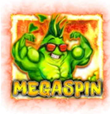
Wild Mega Wasabi