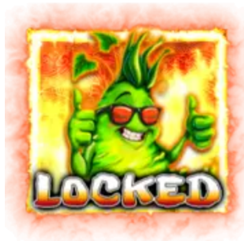
Wild Locked Wasabi