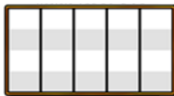
MAIN REEL SET 5 X 4